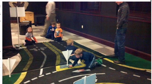
Testing a roundabout with match box cars.