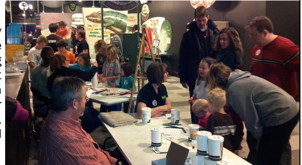
Water testing and the straw bridge activity (back).