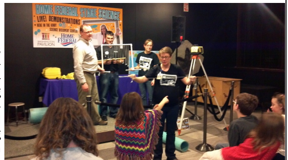
Demonstrating the take-away pendulum.