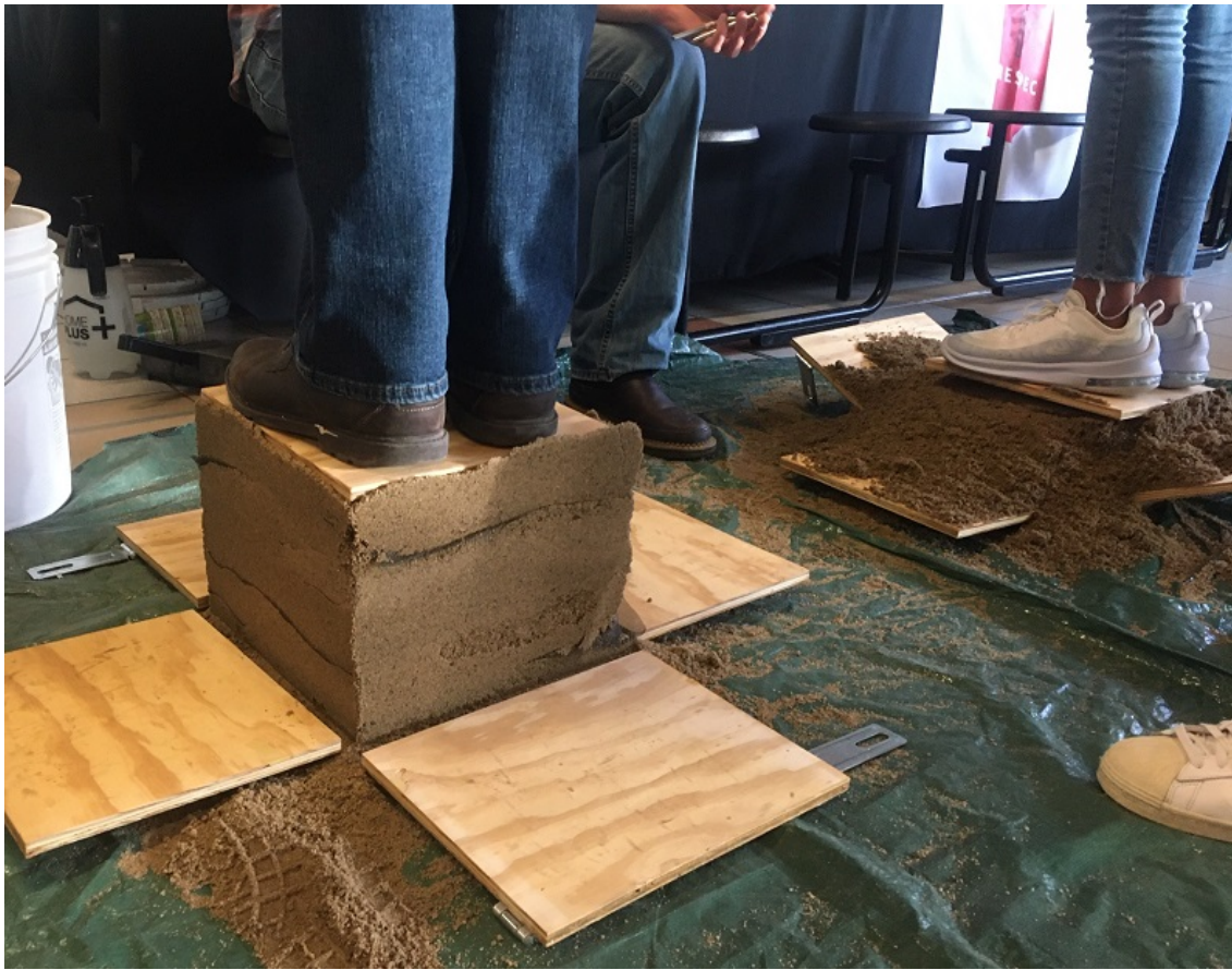
Central HS students test reinforced vs unreinforced soil. SDES and RESPEC hosted a joint booth at the high school STEM career fair.