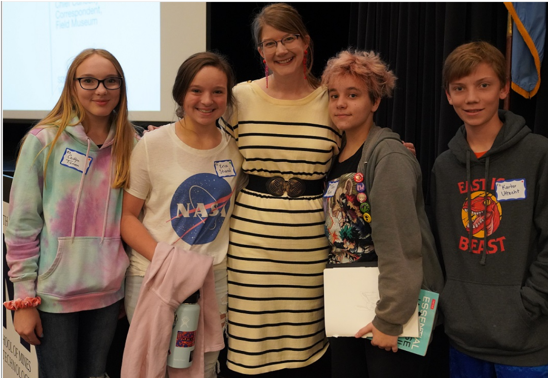
RCAS 8 th Grade Students with featured speaker, Emily Graslie. Emily is a Rapid City Native, host of the popular YouTube channel “The Brain Scoop”, and Chief Curiosity Correspondent for the Field Museum in Chicago.