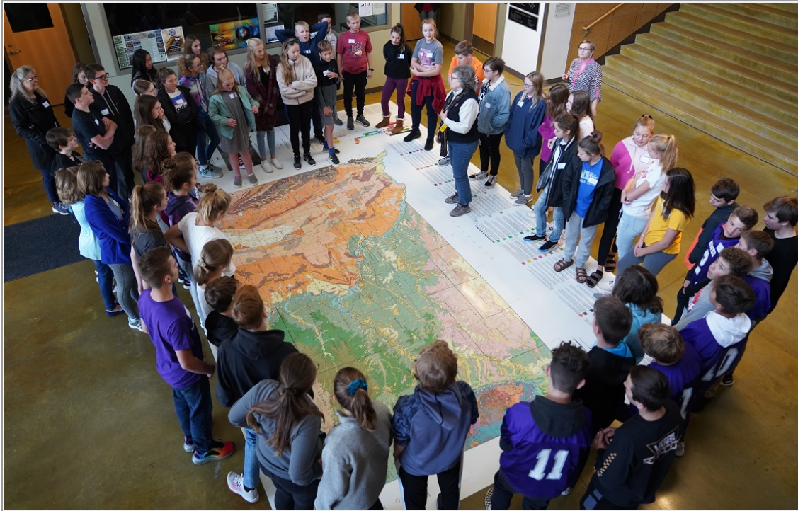
RCAS 8 th Grade Students touring the Paleontology Research Laboratory at the South Dakota School of Mines and Technology.