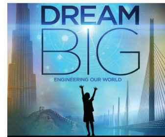
"Dream Big" 7 p.m.

Experience Your Washington Pavilion 301 S. Main Ave. Sioux Falls, SD 605.367.6000 | washingtonpavilion.org