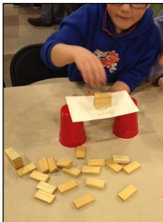
Glue is the Clue Bridge Activity