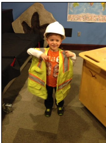
A guest trying on a hard hat and safety vest after the demonstration