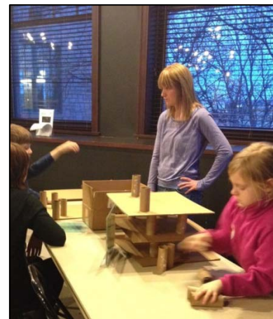
Tumbling Tower Activity