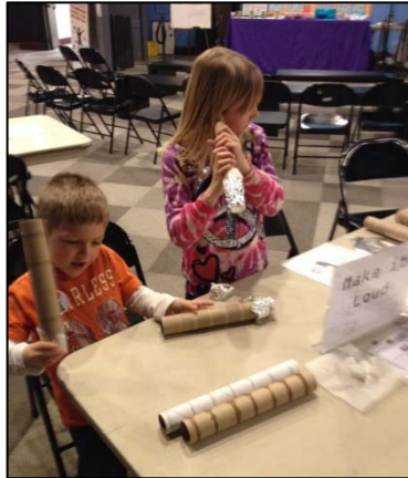
Make it Loud Activity