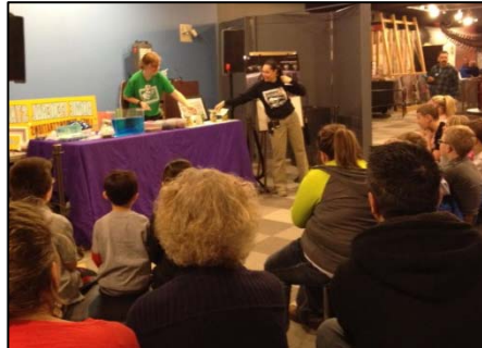
Demonstration by Kirby Science Center covering several different engineering disciplines