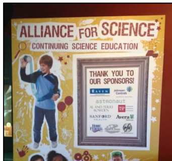
SDES Donation to achieve Alliance for Science Status

Free First Friday's at the KSDC and Washington Pavilion was held on Friday, February 7 th from 5pm to 8pm. Five volunteers from SDES and several KSDC staff helped those in attendance celebrate and discover engineering through hands-on experiments, teamwork challenges, and engaging demonstrations. The demonstration covered a bunch of engineering disciplines and ended with the guest engineer (me) asking the crowd to think about where their water comes from and exploring the Sioux Fall and Lewis & Clark Regional Water System's 3 Million Gallon water tower at 85 th Street in Sioux Falls. The crowd was shown pictures from construction, and given the opportunity to try on a hard hat, safety vest, and a safety harness. Six activity stations were set up in the area that had the kids and their parents exploring roller coaster design, bridges, and soundproofing to name a few. In the lobby, the First Tech Challenge's Fellowship of the Loose Screws Robotics Team had their practice ring and robot set up and moving for people to see, and Sioux Falls New Technology High School students were there to display their Art Electric Projects. The students designed and constructed their own works of art incorporating light sources, switches and batteries.