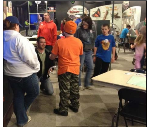
Thrill Seekers Activity about Rollercoasters

The Annual Awards Banquet , a joint banquet with SDES and ASCE was attended by 46 members and award recipients on Saturday, February 22, 2013. Tickets were only $25/person, with the associations and the Pavilion covering the remaining cost. Three SDES Scholarship recipients and their families were also in attendance. Door prizes were given out and included a $50 gift certificate to Scheels from SDES, a $50 gift certificate to Shell Gas from ASCE, and 3 tickets to the Toulouse-Lautrec Art Exhibit in the Visual Arts Center (exhibit from Moulin Rouge era, if you remember the 2001 film). Please consider attending the Awards Banquet in the future. It is not limited to those up for nominations or on the agenda; all SDES and ASCE members are welcome to this annual banquet to celebrate engineering. It is a great networking event and an enjoyable night out among your peers.