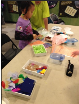
Soundproof Package Activity