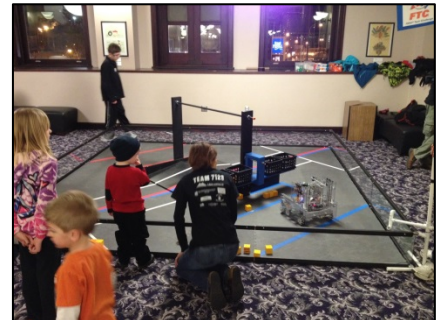
First Tech Challenge Robotics Team Field and Robot