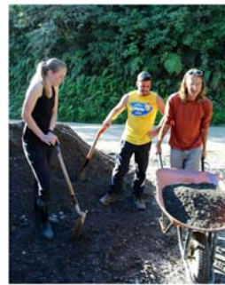
Transfer Construction Materials