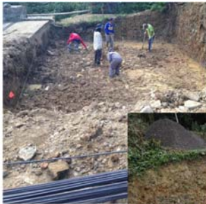
Excavation and Filter Slab Installation