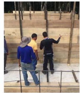
Steel Reinforcement and Walls Forms