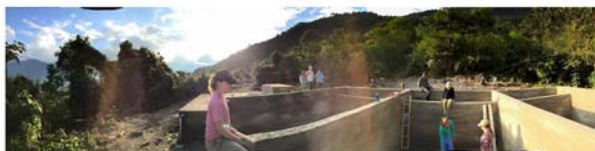
Sand Filter for Upper Campus