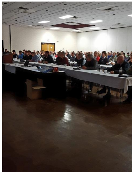
A snapshot of the over 130 professional engineers attending the SDES 2016 Fall Conference. Thanks to everyone for supporting SDES by attending the conference.